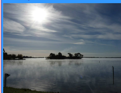
Hazelwood Pondage—Sauna Sail