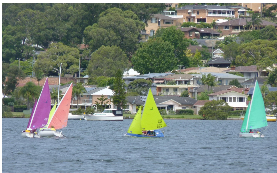
303 Sailors in action at Gosford Sailing Club