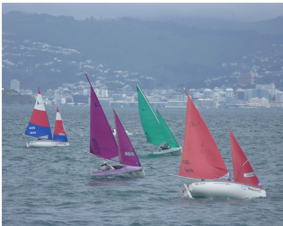
Liberties in Wellington at the New Zealand Hansa Class Championships

Supporters are urged to sign the petition to have sailing reinstated in 2020 and send letters and emails of support to ISAF at disabled@isaf.com