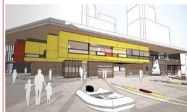
Artist Impression—Community Boating Hub