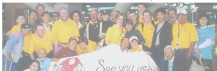
Farewell at the Airport